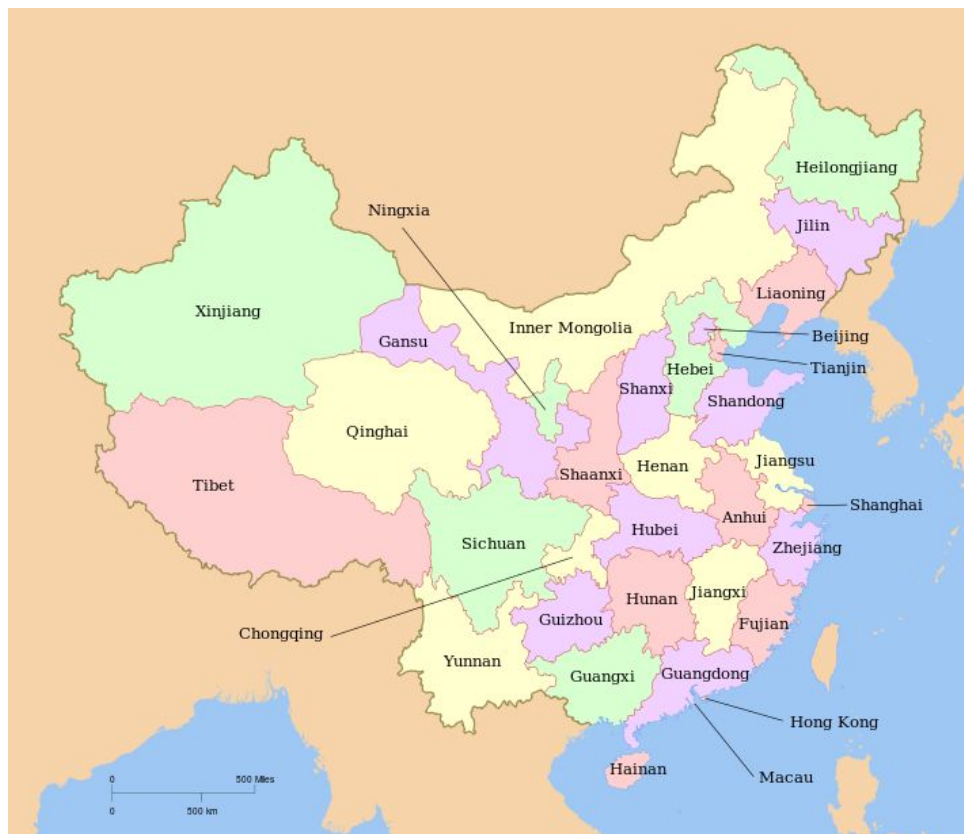
Map 1: First Order Admin Divisions of China 11

LOCATION: A populated place (city, village, etc.), natural landmark (hill or mountain, bay, etc.), or a distinct location outside the borders of a population center (military bases, rural airports, etc.)