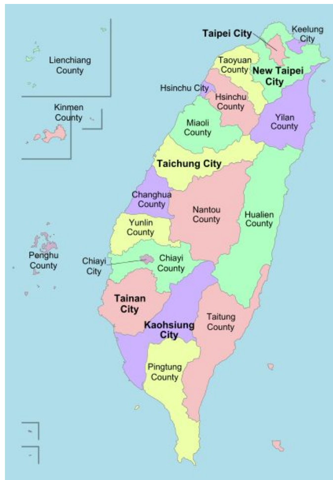
Map 2: First Order Admin Divisions of Taiwan 12

LOCATION: A populated place (city, village, etc.), natural landmark (hill or mountain, bay, etc.), or a distinct location outside the borders of a population center (military bases, rural airports, etc.)